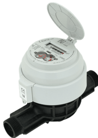
JV600 - Water Meter Janz (current aspect)