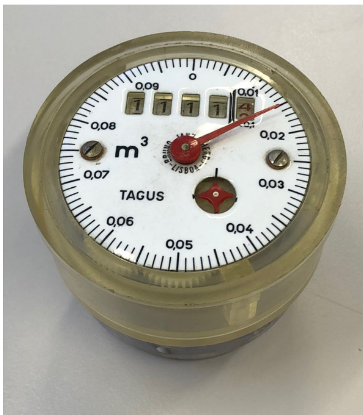
1958 - First plastic piece produced by Janz