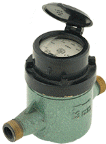
First plastic water meter produced by Janz (1958)