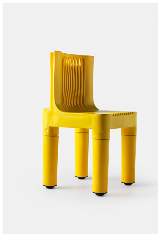
"K 1340" children's chair, design by Marco Zanuso and Richard Sapper, Kartell, 1964